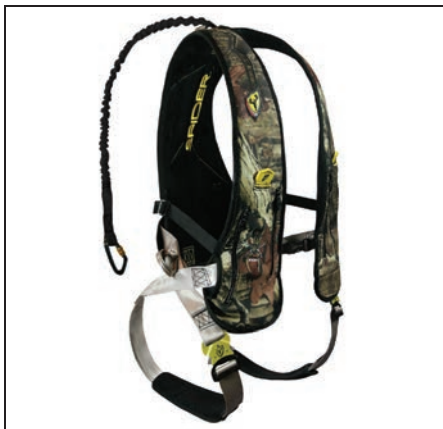
Robinson's Tree Spider Speed Vest has convenient front mounted pockets.

While the Tree Spider Speed Harness, Speed Vest and Micro Harness are all easy to put on either over or under clothing Robinson went one step further when using the harness