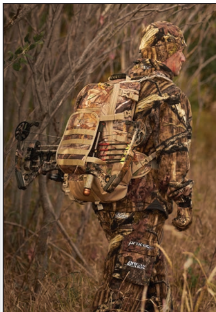
The Spider Monkey pack can be used as a conventional backpack or attached directly to Robinson's safety harness.

Robinson has in design a Safety Harness system for smaller and lighter weight users as well as a model designed for the female form. No date has yet been set for the availability of these items.