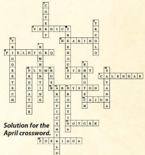
Solution for the April crossword.